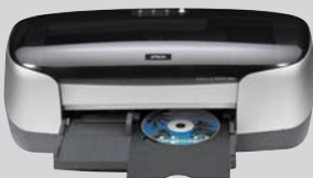
EPSON Stylus Photo 960