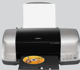
EPSON Stylus Photo 900