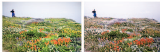
High color light output