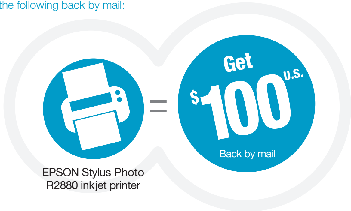
EPSON Stylus Photo R2880 inkjet printer

Buy an EPSON Stylus ® Photo R2880 inkjet printer and receive the following back by mail: