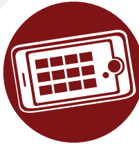
Epson P-2000 multimedia storage viewer

Buy an Epson® P-2000 multimedia storage viewer and receive the following back by mail: