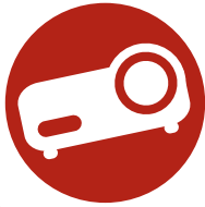
Epson PowerLite Home Cinema 1080