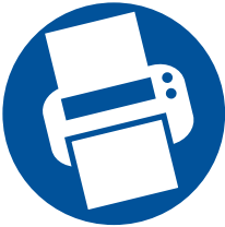
Epson Stylus Photo 1400, R1900 or R2400

Buy an Epson Stylus ® Photo 1400, R1900 or R2400, together with one pack of qualifying Epson Photo Paper Glossy, and receive the following back by mail: